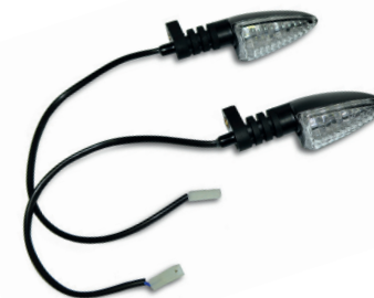
LED INDICATORS KIT