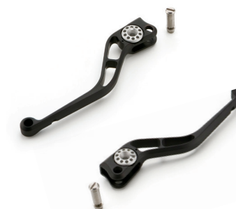
RACING LEVERS KIT