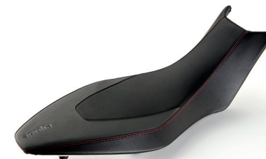
GEL COMFORT SADDLE

DISCOVER THE ENTIRE RANGE OF APRILIA ACCESSORIES AT WWW.APRILIA.COM