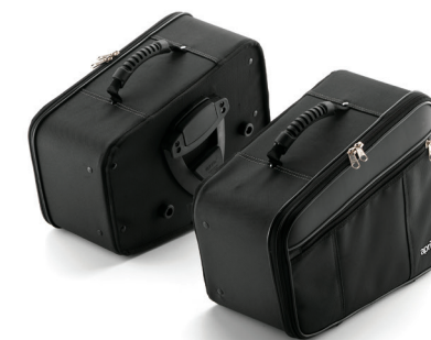
SEMI-RIGID PANNIERS KIT